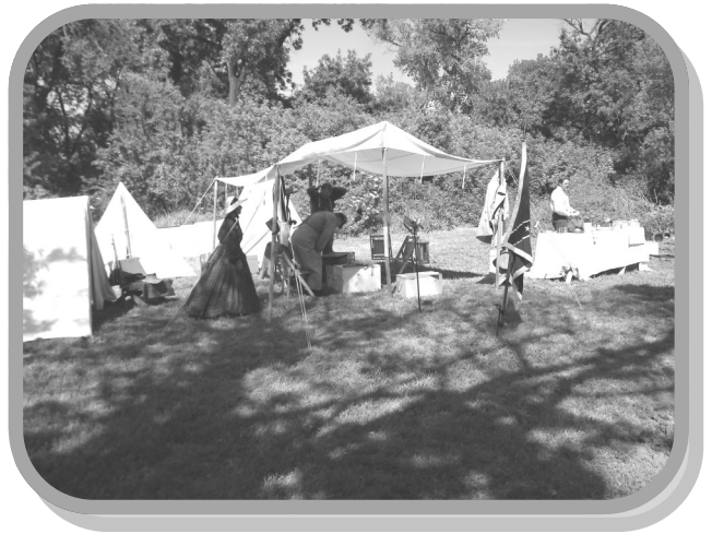
NEW THIS YEAR - Reenactors of the American Civil War will bivouac under the trees on the west side of Habert Park