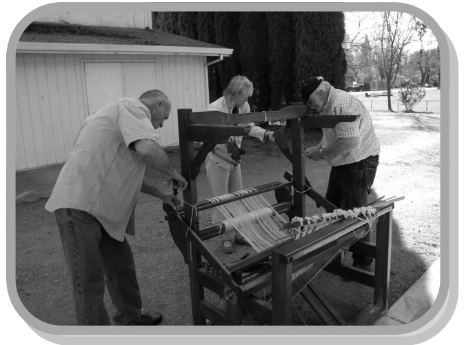
EXPANDED THIS YEAR - The Fiber Arts demonstration in the Annex will include weaving on this loom, carding, spinning.